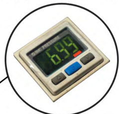
Digital pressure gauge