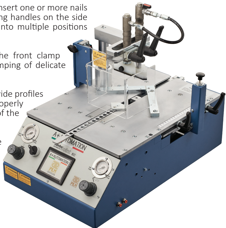
JUMBO JOINT AUTOMATIC EC 2 POS. SHOWN WITH THE OPTIONAL SELF-LEVELLING HOLD DOWN

All of the controls and adjustments are located on the front panel permitting easy access.